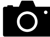
A Recording Device